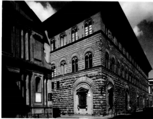
Michelozzo (and Brunelleschi), Palazzo MediciRiccardi, Florence, begun 1445, Seen from the via Cavour