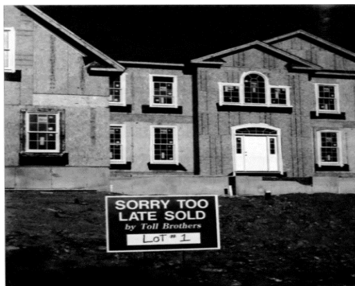
McMansion under construction, 2013 Westchester County, NY Fig 1. Examples of McMansion

Some scholars have criticized McMansions, who think that they run counter to the scientific nature of architecture but show subjective expression of the owner or designer of the house and the owner's own rights, status, wealth and personal aesthetic preferences. Ada Louise Huxtable expressed, "in the world of dream-house McMansions, the preferred style is Grotesquely Grandiose. Unencumbered by architects or accuracy, developers offer a mind-boggling mix of Rapunzel towers and pretend Palladian, Jacuzzis and surround-sound." Besides, other scholars believe that McMansions record and display history, truly reflecting the social realities and people's ideology at a specific time. This article believes that the phenomenon of McMansion is inevitable against certain stage of human and cultural development and caused by intricate anthropological reasons. However, in the context of contemporary society, the development and spread of this phenomenon is not advocated and the design of residential buildings should return to the essence of architectural design—providing conditions for more people to live safely and conveniently. Instead of its commercial value, the social and economic value of a building should be given priority in its design. In a word, true architecture should be in harmony with its surroundings, not being commercialized or wasting resources.